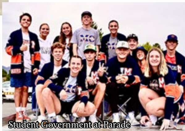
Student Government at Parade

See more photos from Mountain Crest's Homecoming on the back page!